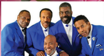
HAROLD MELVIN'S BLUE NOTES