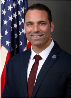
Raymond A. Giacobbe Mayor of Rahway, NJ