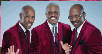
RUSSELL THOMPKINS JR. AND THE NEW STYLISTICS