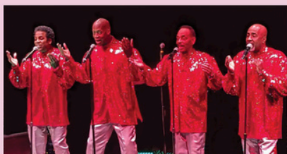
THE TRAMMPS FEATURING EARL YOUNG